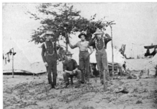
WILL ROOT'S TREE EVER TAKE ROOT?