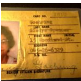
Senior Residence ID card