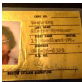
Senior Residence ID card